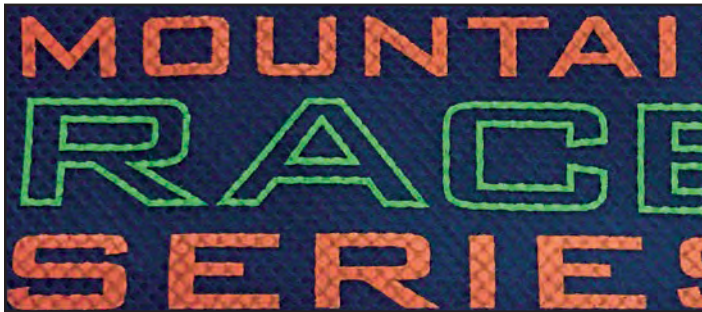
2-color solid screen imprint detail shown at 100%

Artwork must be pre-approved as color registration requirements exist and vary per bag style. Some movement between colors will occur due to the printing method required for post-converted bags.