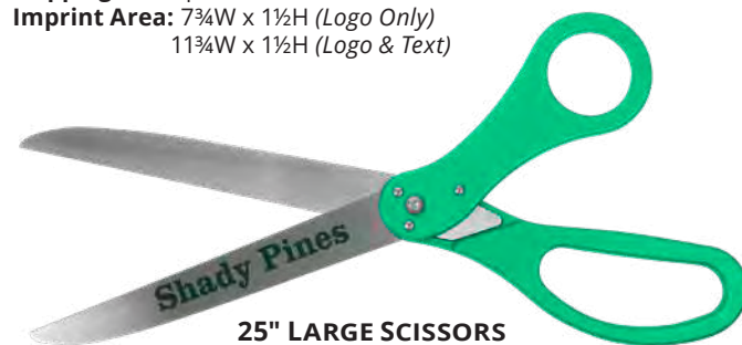
25" LARGE SCISSORS

Shipping: 4 lbs. per box of 1 Imprint Area: 7¾W x 1½H (Logo Only) 11¾W x 1½H (Logo & Text)